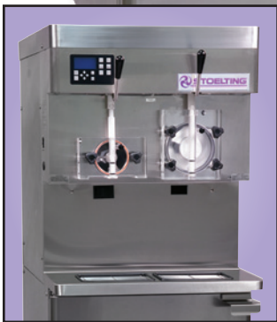
Model U444 (without mixer)