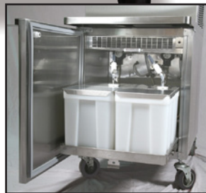
Refrigerated Cab showing slide-out mix shelf & bag connection system